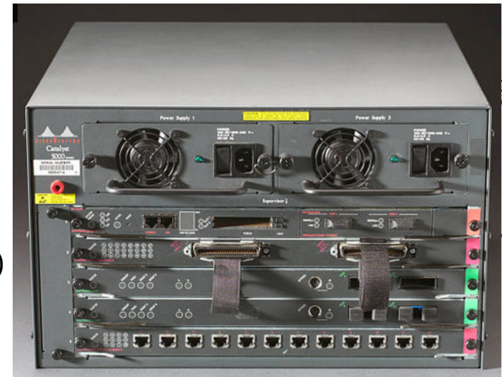
Catalyst 5000 (Paul Thornton – LINX97)